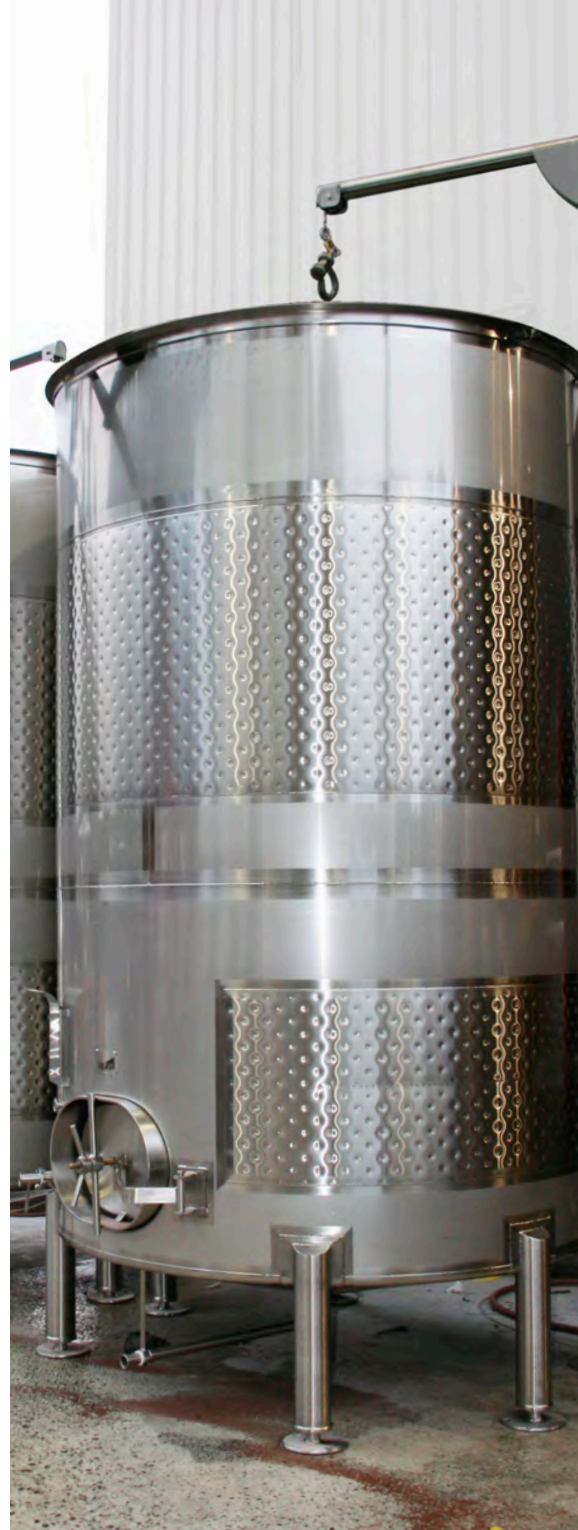
80 BBL Variable Capacity Open Top Cider Tanks Blue Mountain Cider Company