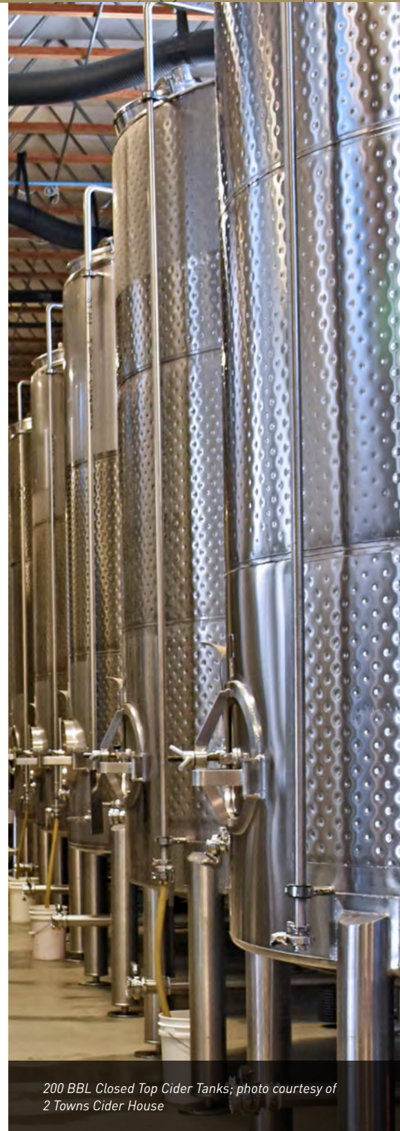
200 BBL Closed Top Cider Tanks