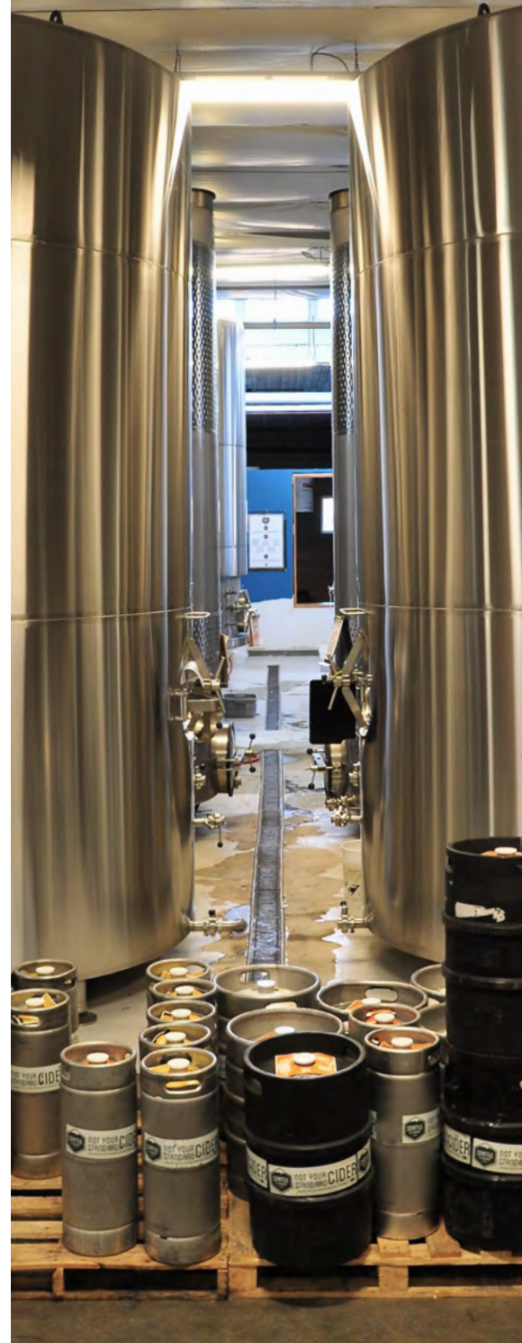
200 BBL Bright Cider Tanks