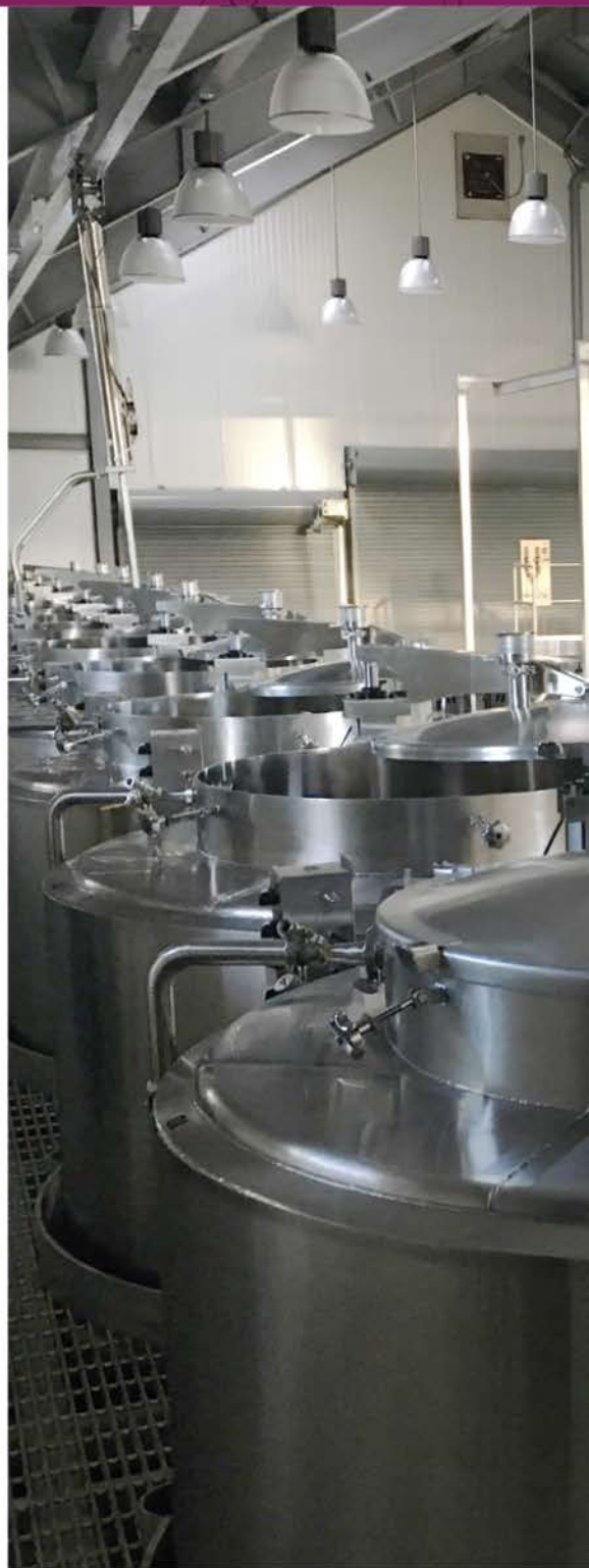
4-5 Ton Voltage Series Wine Tanks with AirLift Top Door; photo courtesy of Wheeler Farms Winery

Standard Sizes: 39" and 48" diameter tank opening.